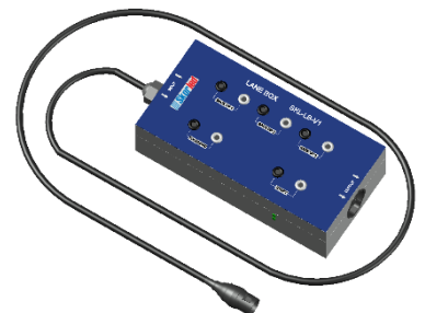
Lane Box (SKL – LB – V1)