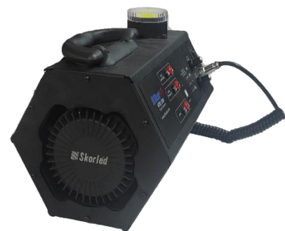
Race Starter (STR – 100)