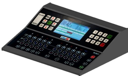
Swimming Controller (Timer) (SKL – SWC – V2)